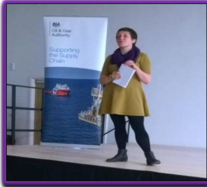
Westminster MP Kirsty Blackman